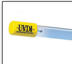
Bulbs are rated for 9000 hours of lamp life and provide maximum UV-C irradiance.