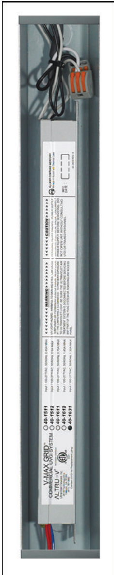
Ballasts are designed to easily mount in vertical support strut, reducing installation cost.

Contact UVDI or a distributor to learn how the V-MAX GRID™ can improve your indoor air quality.