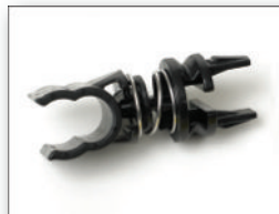
V-MAX Mounting Clips snap into support strut and attach easily onto either lamp ends or bulb.